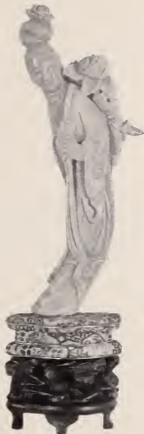
LITTLE FIGURE CARVED IN CORAL